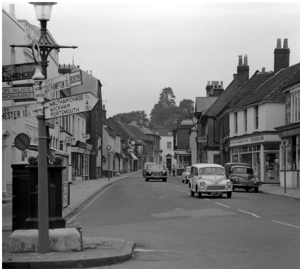
Bishop's Waltham High Street, 1967